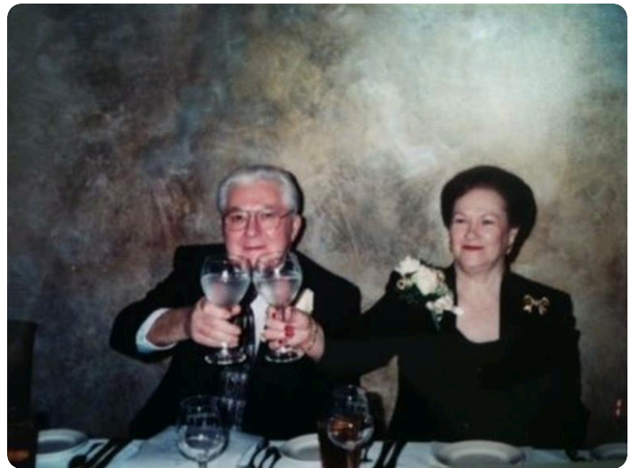
50th Anniversary Party